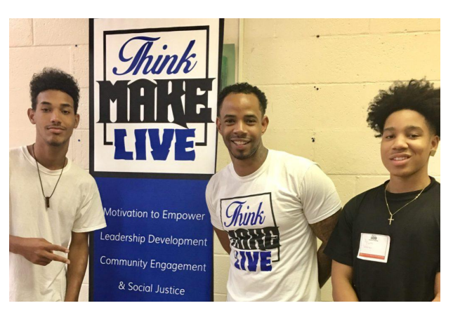
June 14, 2016 Founded Think Make Live LLC