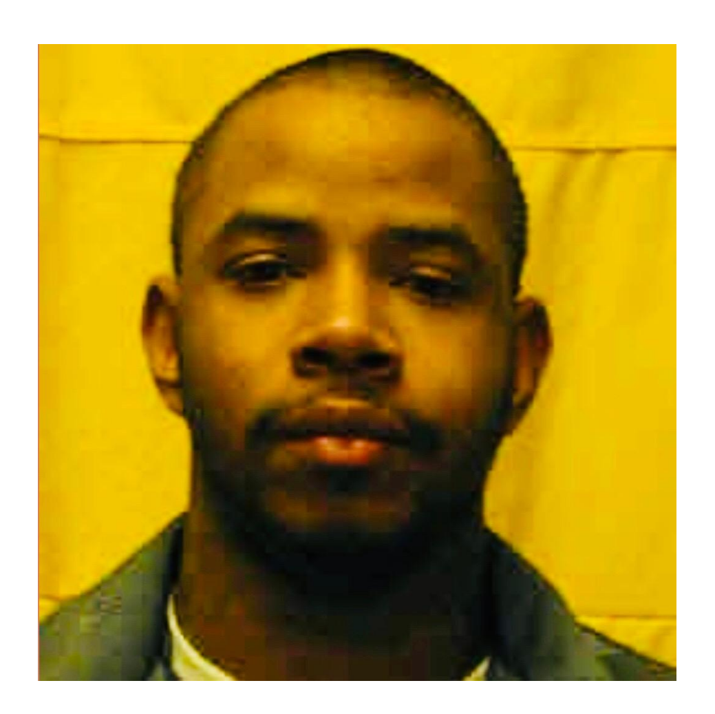
March 18, 2009

From being labeled as a statistic to society to now creating solutions to disrupt statistical barriers