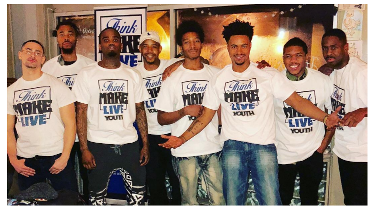
February 2, 2018 Launched Think Make Live Youth non-profit