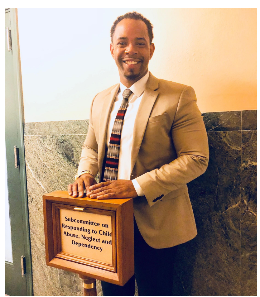
August 22, 2018

Sentenced to serve 4 years in prison at Southeastern Correctional Complex in Lancaster, Ohio