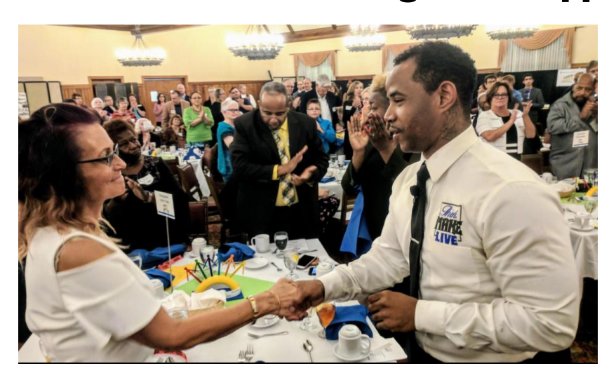
Think Make Live LLC Social justice consulting firm