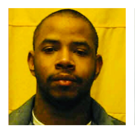
March 18, 2009 Sentence to prison