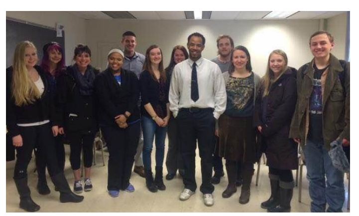
March 4, 2015 Think Make Live powerpoint at OSU