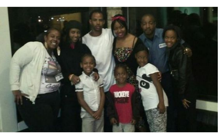
March 12, 2013 Released from prison