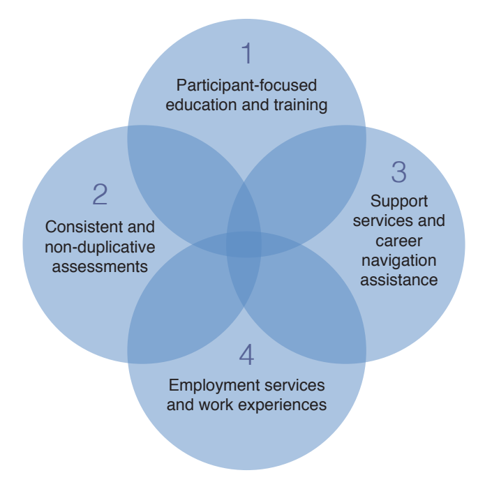
Figure 2: Four Essential Functions of Career Pathways and Programs

The four essential functions of career pathways—and any programs linked and aligned within the pathway—include: